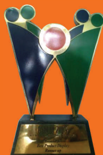
Best Product Display Runners up- ASOCIA 2004