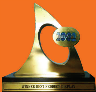
Best Product Display - INFOTEL 2002