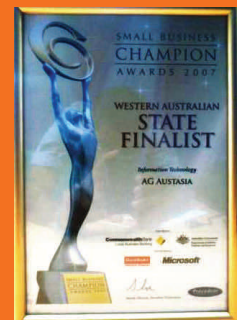
State Finalist- Business Champions Award 2007, Australia